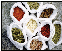
Some Traditional Chinese Herbs as seen in their raw form

For this reason, I am proud to carry the JR Labs line of concentrated herbal teas. These herbal teas are designed and custom handcrafted in the US by the makers of the very finest concentrated teas in the world. The herbs that are used in these teas are either grown organically here in the US or grown and harvested under very specific standards in the most fertile soils throughout various regions of China.